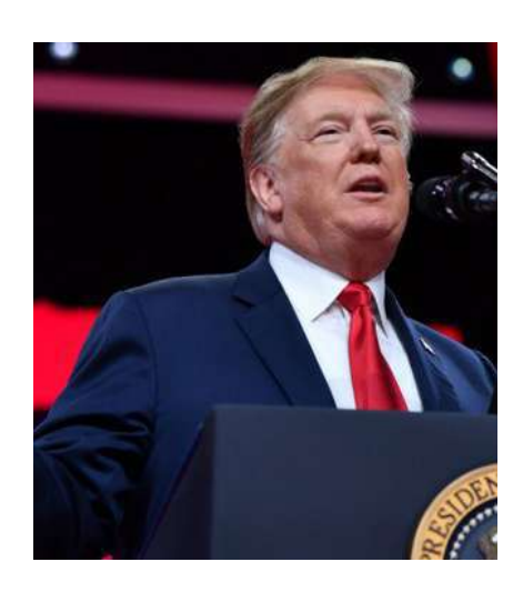
President Donald Trump